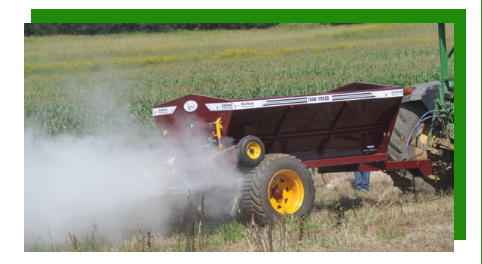
Broadcast fertilisers with GPS guidance and accuracy