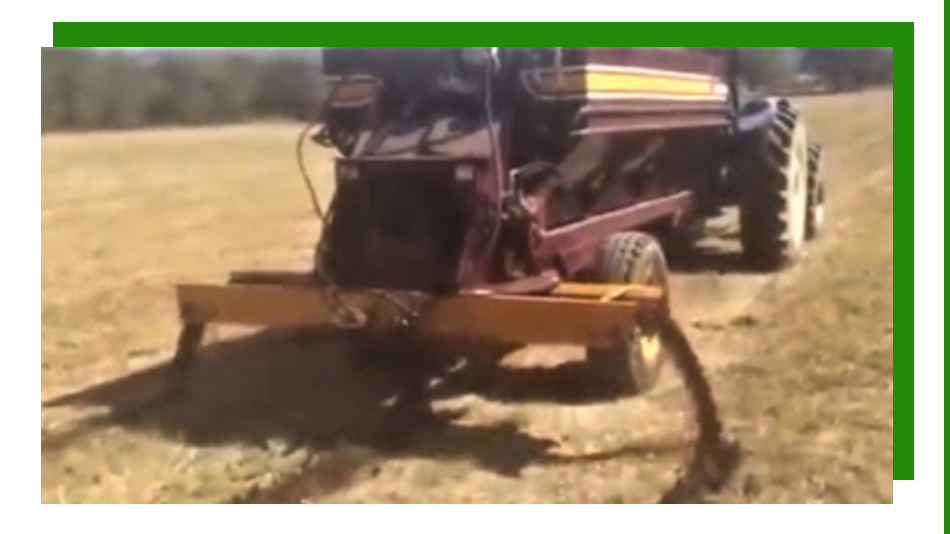
Band - spreader attachment for row crops and under plastic mulch